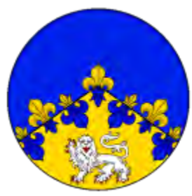
Imperial Archives office.

3. Use the lines on your form to draw your chevron correctly, if it looks "wonky" it might be returned.